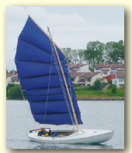
"Broremann", with a cambered panel sail, sailing at Stavanger, Norway - small is beautiful!