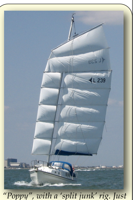
"Poppy", with a 'split junk' rig. Just one example of recent junk rig innovation - windward performance without losing the rig's advantages.