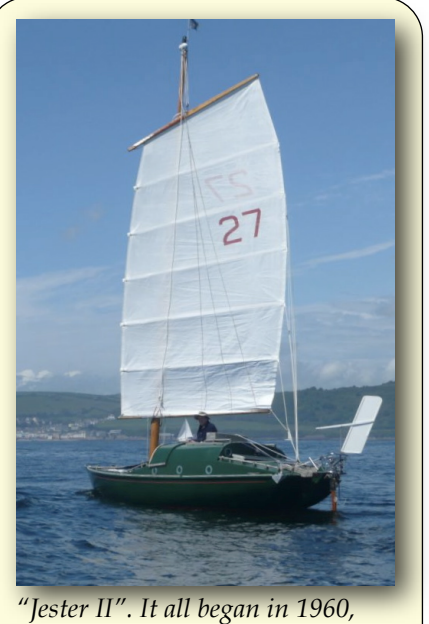
"Jester II". It all began in 1960, when Blondie Hasler entered "Jester" in the first single handed transatlantic race.