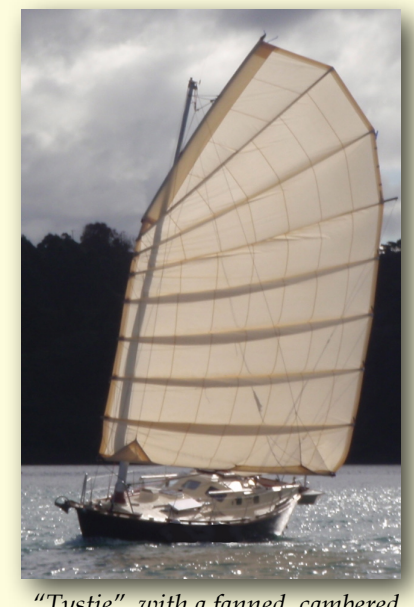
"Tystie", with a fanned, cambered panel sail, sailing in the Hauraki Gulf, New Zealand - large, for a single sail, but fun to use!